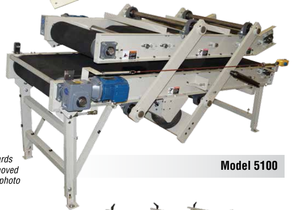
Guards removed for photo