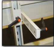
Side adjustment option